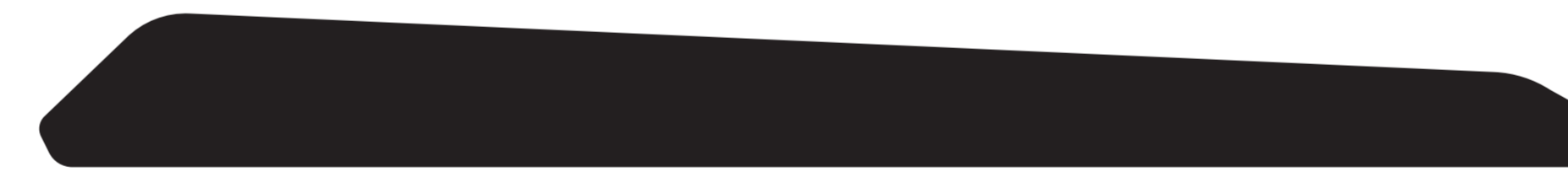
NON-DRIVE SIDE SEAT STAY DECAL