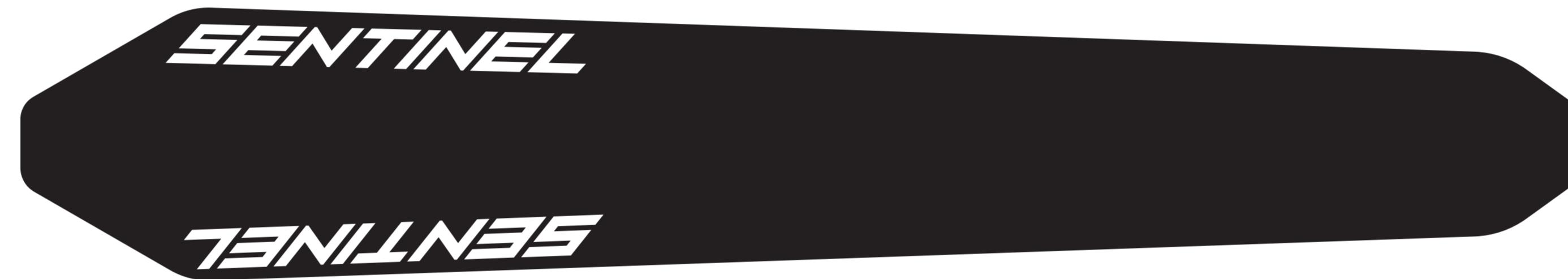
HEAD TUBE DECAL