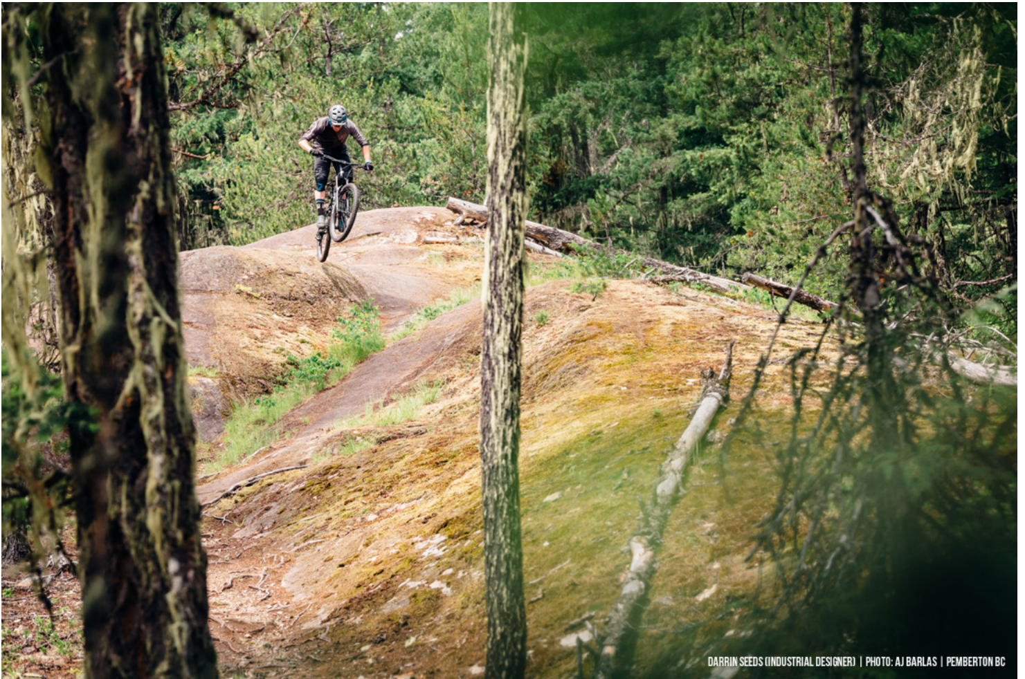
DARRIN SEEDS (INDUSTRIAL DESIGNER) | PEMBERTON BC