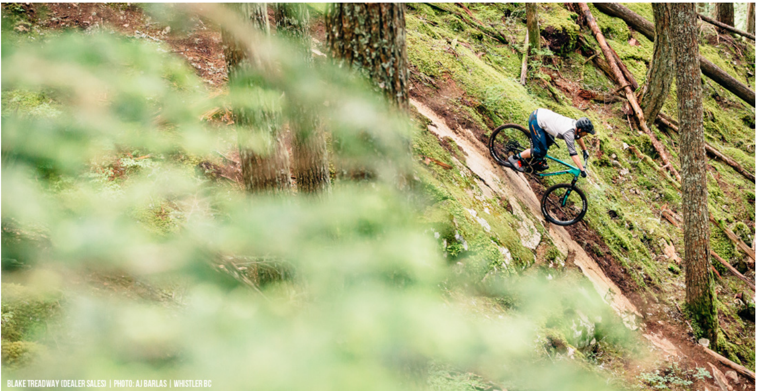
BLAKE TREADWAY (DEALER SALES) | WHISTLER BC