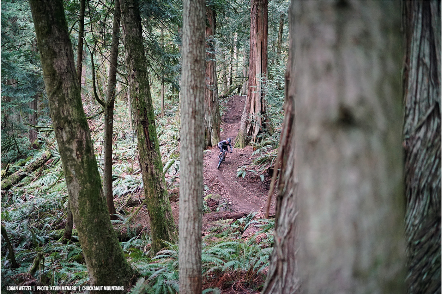
LOGAN WETZEL | PHOTO: KEVIN MENARD | CHUCKANUT MOUNTAINS