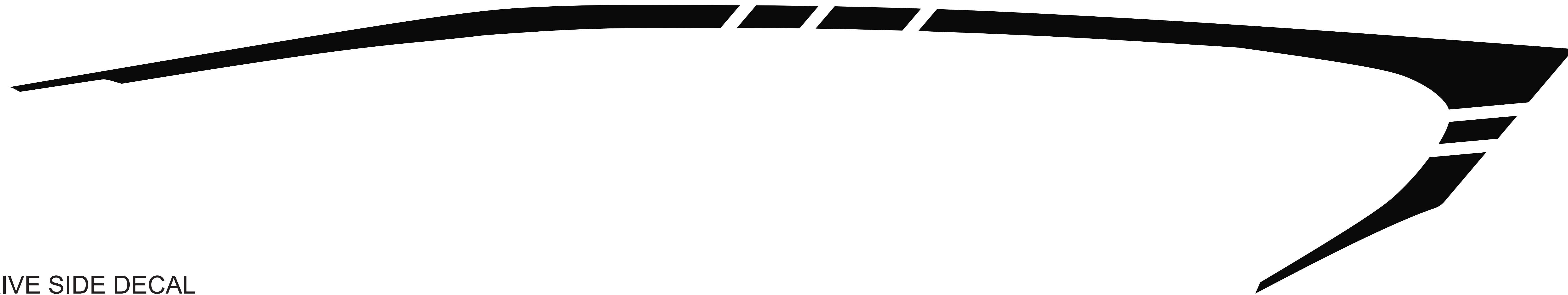
DRIVE SIDE DECAL

Transition Bikes is not responsible for the fit and finish of any aftermarket decals applied to the frame.