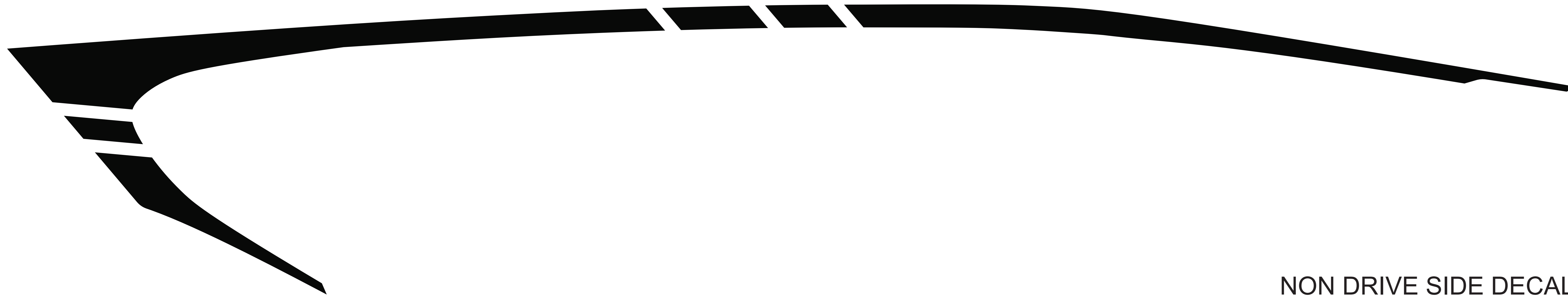
NON DRIVE SIDE DECAL