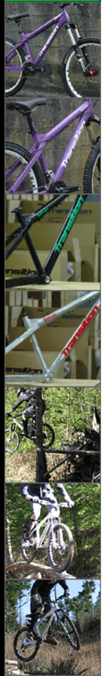
Main | Pricing/Components | Sizing/Geometry | Larger View