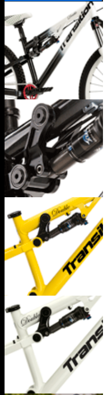
Main | Pricing/Components | Sizing/Geometry | Larger View