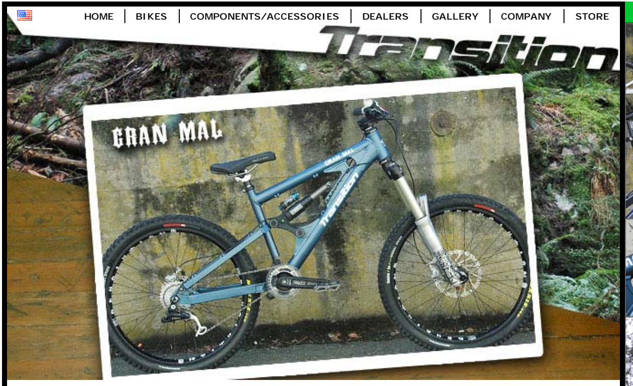
{\bf Main} \mid {\bf Pricing/Components} \mid {\bf Geometry/Sizing} \mid {\bf Setup\ Guides} \mid {\bf Video} \mid {\bf Larger\ View}

Prices are quoted in US Dollars. Click here for Candian Prices