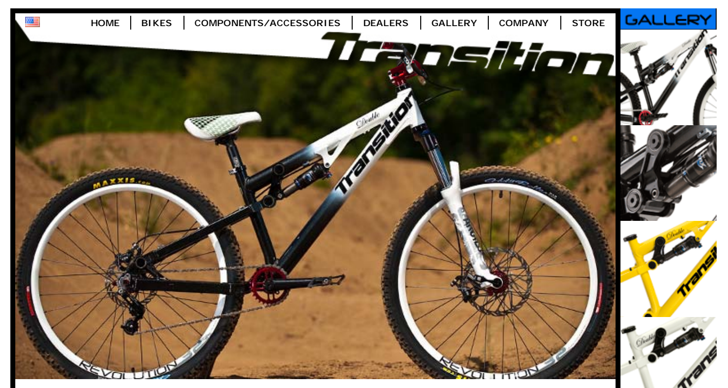
Main | Pricing/Components | Sizing/Geometry | Larger View