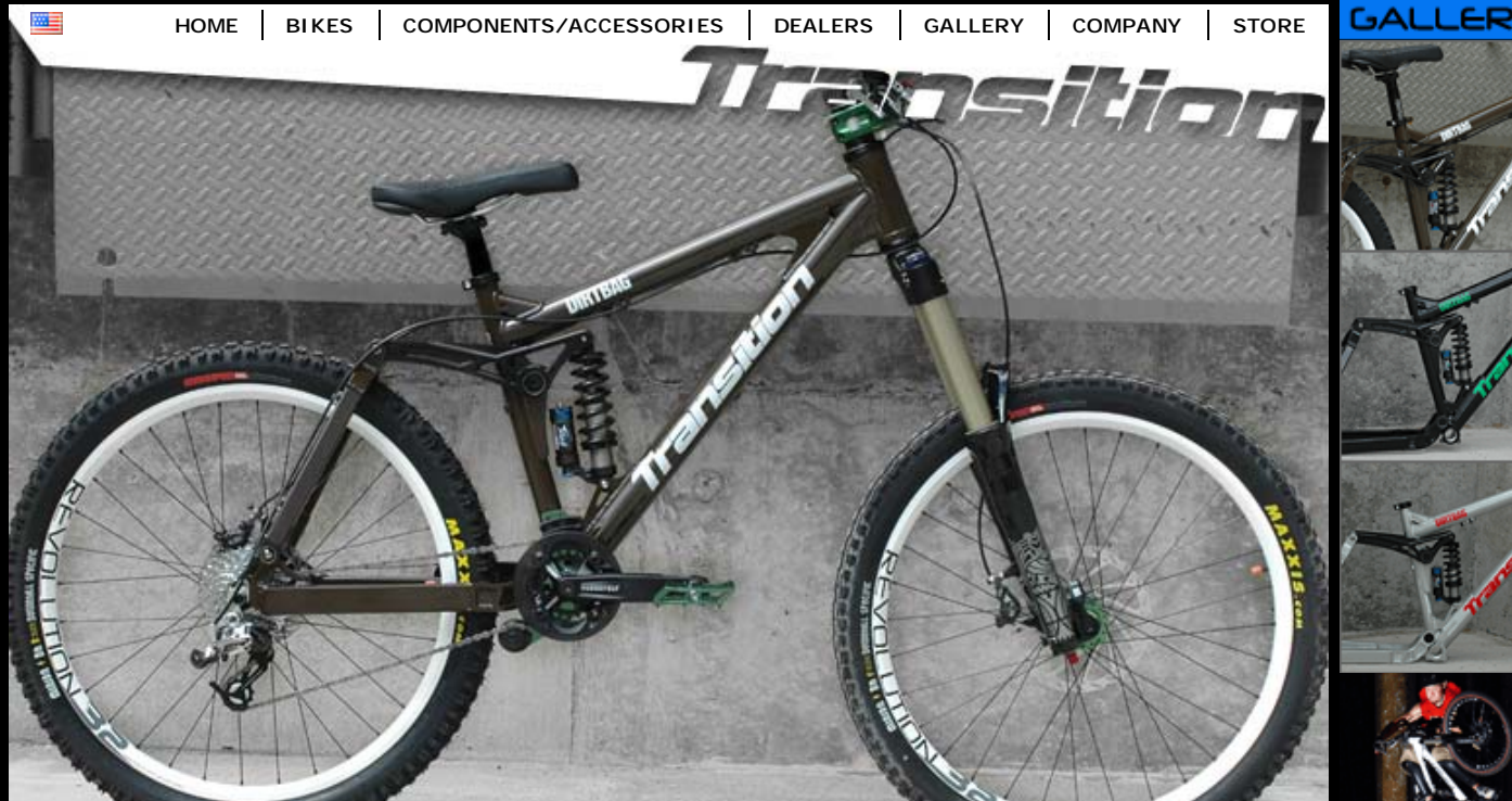
Overview | Pricing/Components | Video | Sizing/Geometry | Larger View

The DirtBag is built for the classic freerider that must be able to handle any stunt, jump or drop in front of them as well as pedal to the top. If you are looking for a great all around freeride bike that is plush for the rough stuff but still quick and maneuverable on skinnies, jumps and singletrack, the DirtBag won't disappoint. The DirtBag is our sentimental favorite bike that is constantly winning over riders for its versatility and burliness.